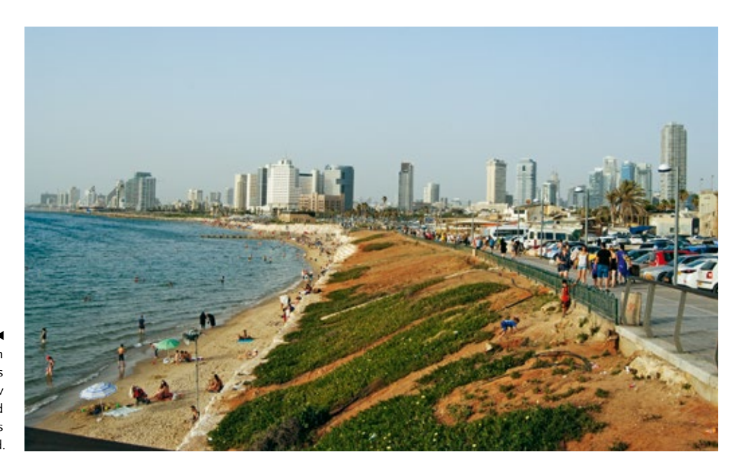
Beach silhouette. With a population of over 400,000, Tel Aviv is Israel's second largest city. Tel Aviv University has 30,000 students and fosters many research partnerships around the world.

A three-day conference on the topic of gerontology took place in June in which seven colleagues from TAU participated. In addition, there are applications for cooperation agreements from three faculties and a new exchange programme for Masters students and doctoral researchers. And linguists are currently working together on a cutting-edge research project.