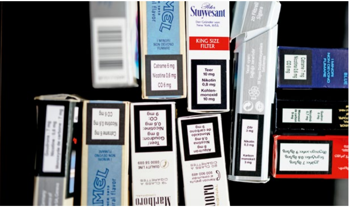
Graphic pictures on cigarette packs: communicative elements intended to influence consumer perception.

way that consumers make those decisions virtually automatically that are desirable from the point of view of consumer policy. An example is defaults in smartphones or other electronic devices which automatically protect the user's privacy. Another everyday example is cashpoints, which are configured in such a way that the money is only issued after the card has been taken. The probability that someone nevertheless forgets to take the card is more or less nil.