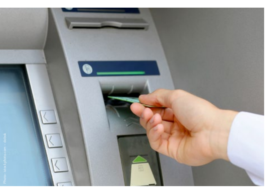
Cashpoints are programmed so that the money can only be drawn once the card has been taken.

Well, in order to allow consumers as great a level of selfdetermination as possible on the one hand and to engage in effective politics on the other, a new political approach known