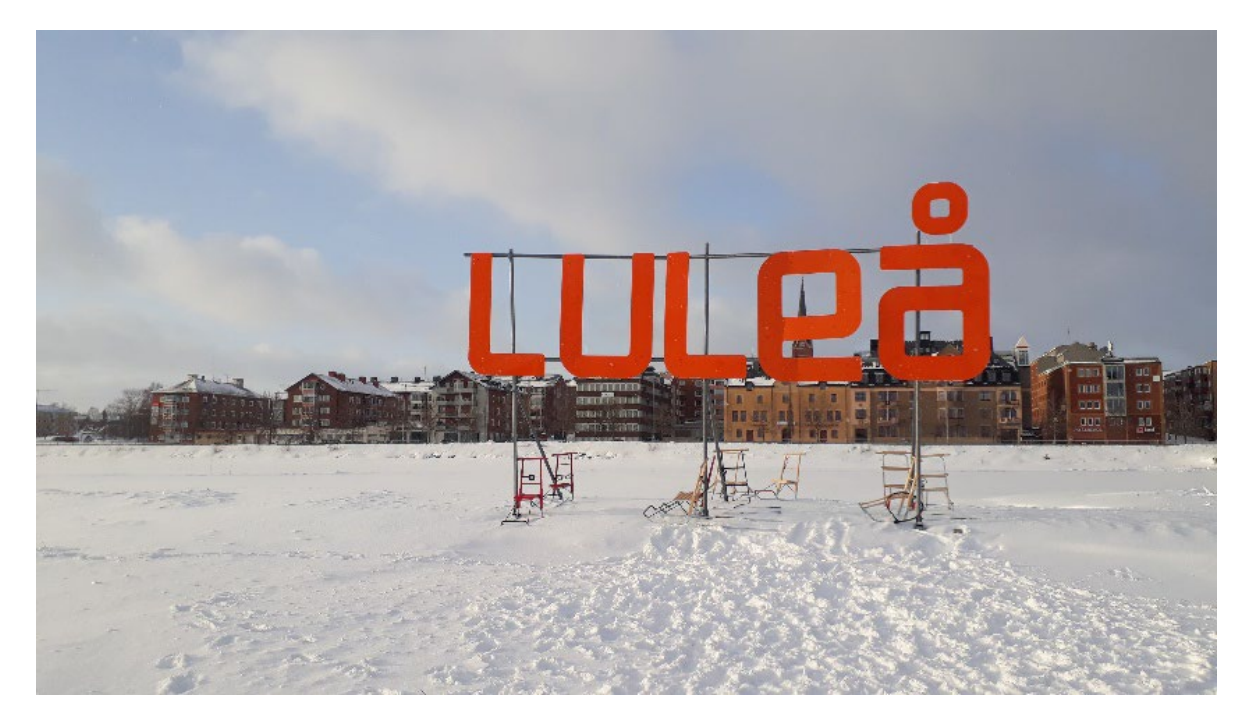
Fig. 1: Luleå in March 2023