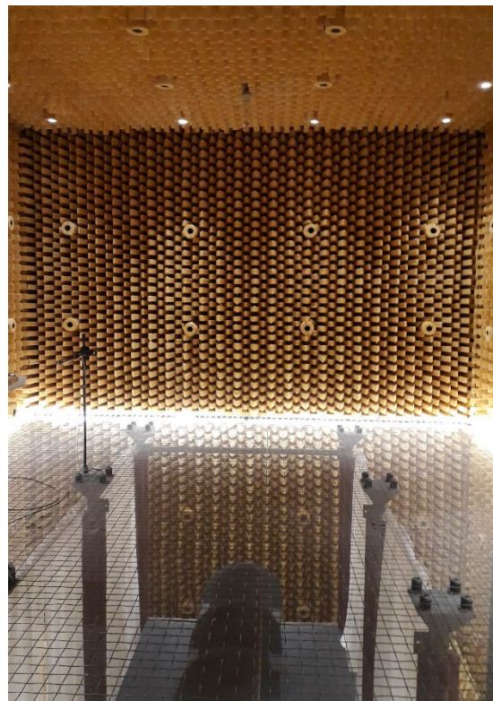
Fig. 3: Robotic Lab, @Gladys Espejo