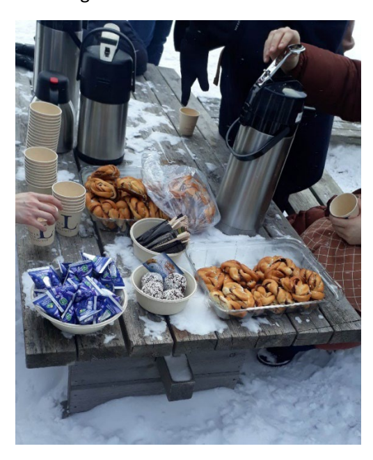
Fig. 5: Fika

Thanks to the cultural activities organised by the host university, the group grew closer together and all participants were able to expand their network. One of the daily highlights of the Swedish culture turned out to be the fika, a typical coffee break with a chat and delicious sweet pastries. Sledding on Luleå's Ice Road and a visit to the UNESCO World Heritage Site of Gammelstad church town completed the great days in Luleå. The perfect ending was a dinner together, after which we went outside to see and marvel at the amazing northern lights.