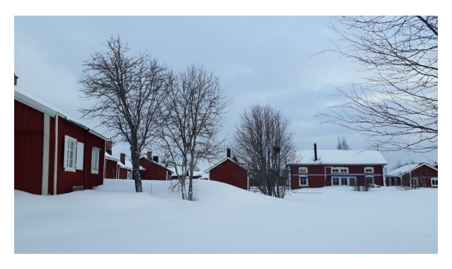
Fig. 6: Gammelstad church town