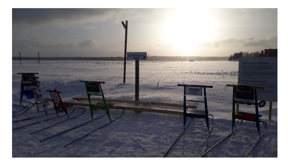
Fig. 7: Ice road