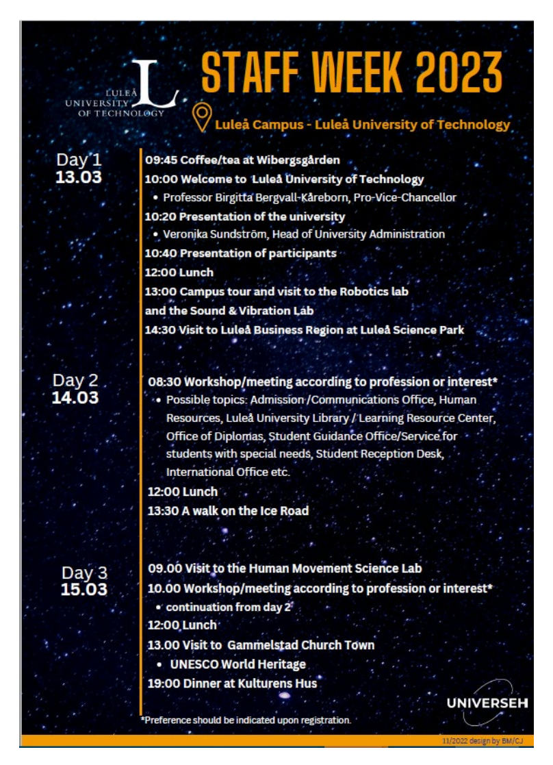
Fig. 2: Staff week programme

During the workshops, we formed groups on various subjects such as the International Office, student and examination administration, communication, library, etc. Here, everyone had the opportunity to present their work field. In our workshop group, we had discussions and collected new ideas that could be implemented at the universities.